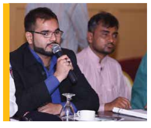
A partnership was created between NOWPDP and Shehri – CBE to bring about pragmatic change in public spaces of Karachi through which a series of seminars were hosted.