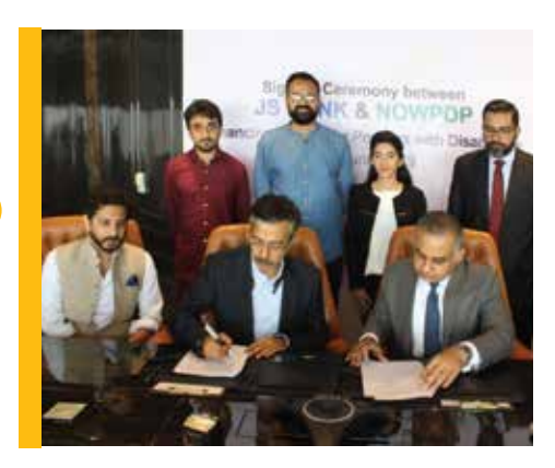
NOWPDP signed a Memorandum of Understanding with JS Bank in order to facilitate self-employment opportunities for PWDs by providing them loans under the State Bank of Pakistan's refinancing scheme