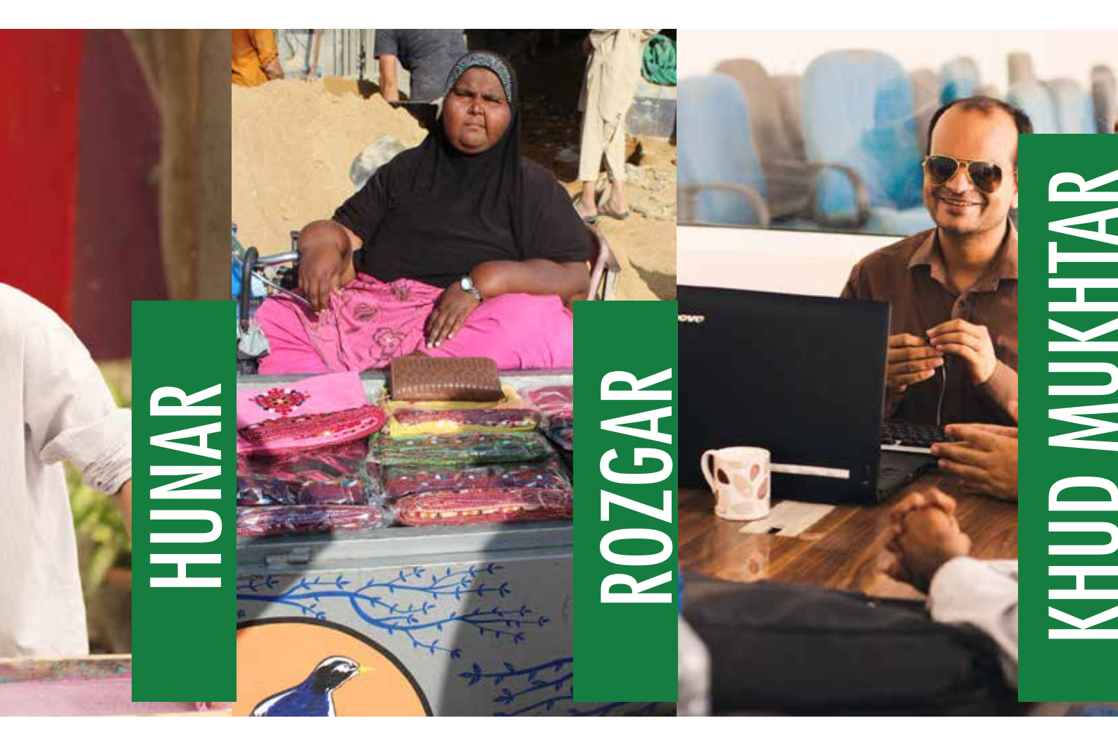
NOWPDP is certified by the Pakistan Center for Philanthropy (PCP), and is a member of the Provincial Council for Rehabilitation of Disabled Persons (PCRDP), Government of Sindh. NOWPDP is also accredited for the Conference of State Parties to the UN Convention of Rights of Persons with Disabilities (UNCRPD) and has obtained a consultative status on the United Nation's Economic and Social Council (UN ECOSOC).