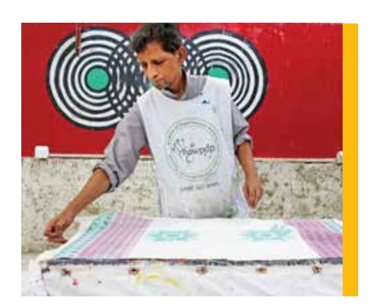
NOWPDP launched its own line of sustainable tote bags to economically empower persons with disabilities and reduce single use plastic waste to help the climate.